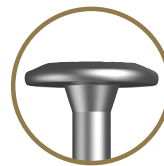
14 gauge large button head iHex