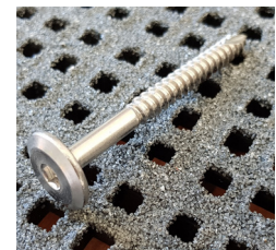
Slip resistant mesh